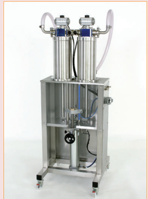
Twin Head 5 Litre Filling Chassis